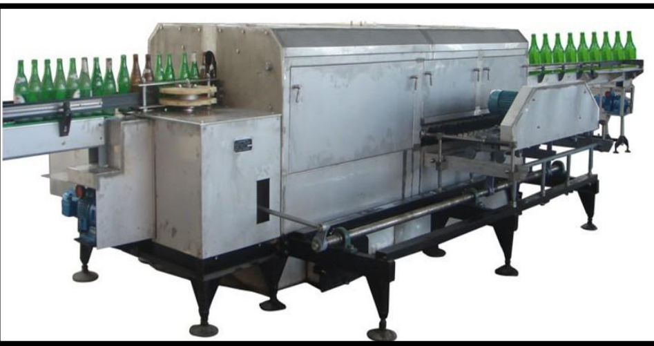
BOTTLE WASHING MACHINE