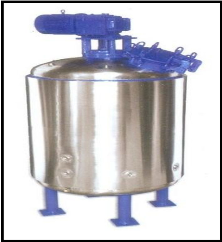
JACKET OPEN TOP VESSEL