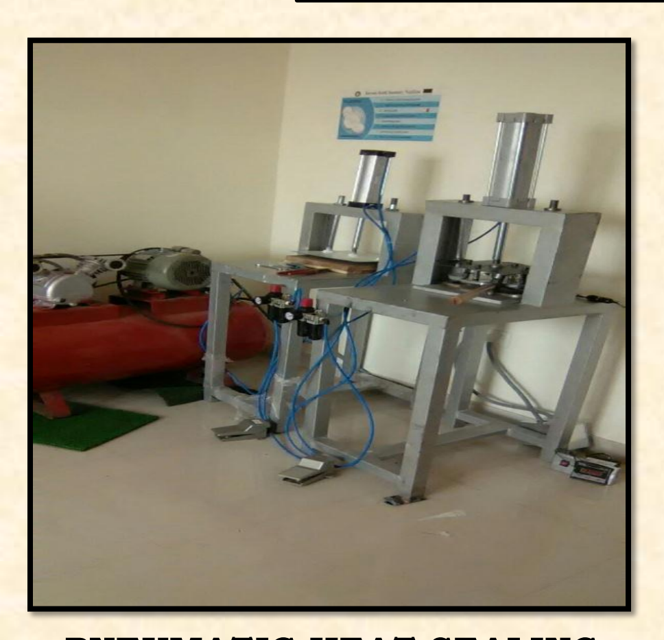
PNEUMATIC HEAT SEALING MACHINE