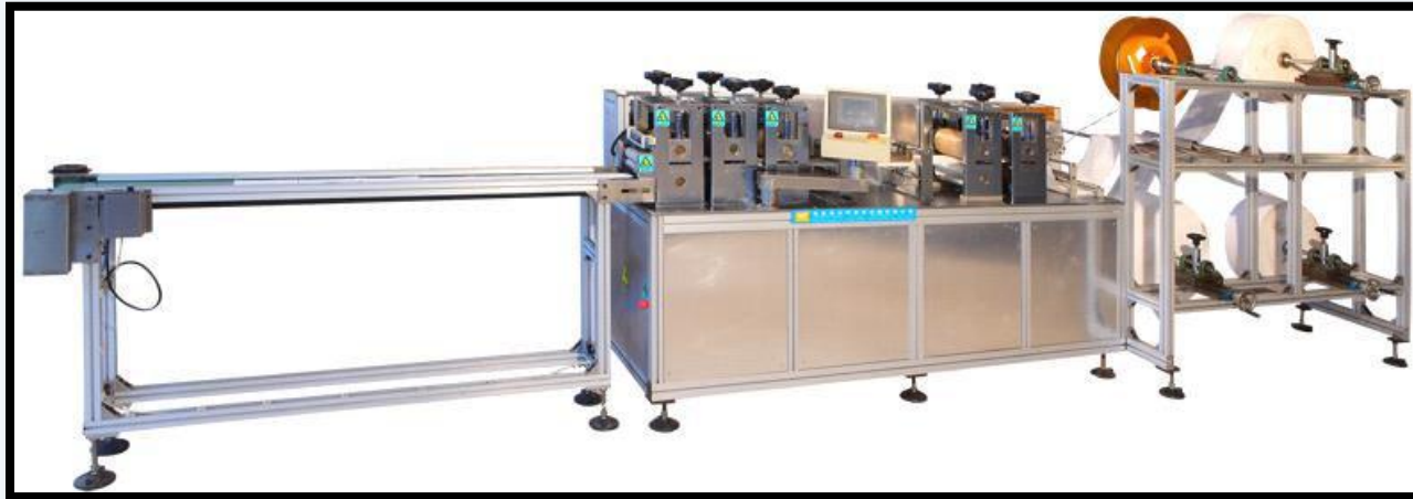
Non Woven Mask Blank Making Machine