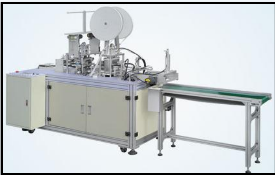
Tie on Mask Making Machine