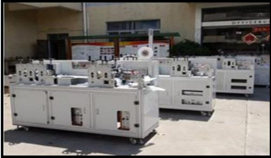
Face Mask Machine