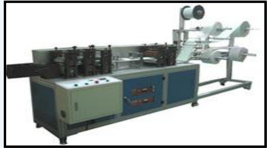
Mask Inner Ear Loop Welding Machine