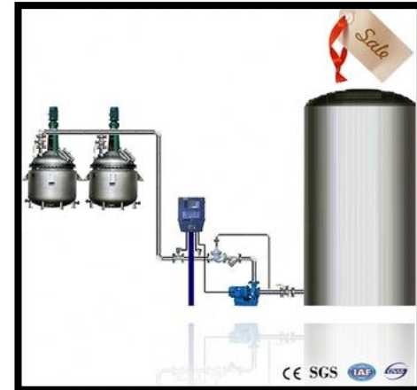
HOT MELT SPRAYING MACHINE