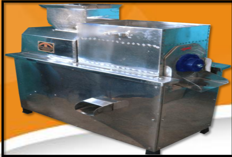
Mango Pulp Section