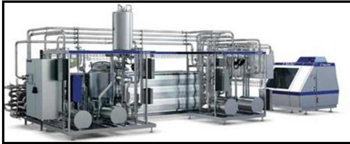
Aseptic Treatment Section