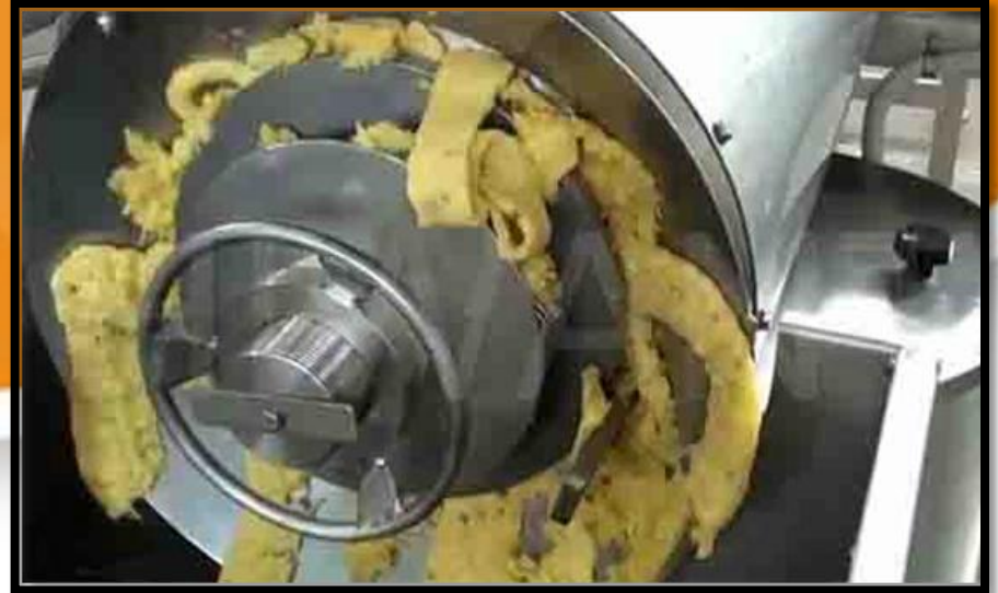
Fruit Preparation and Receiving Section