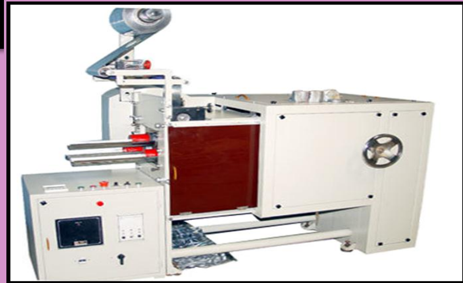
Lid Punching Machine