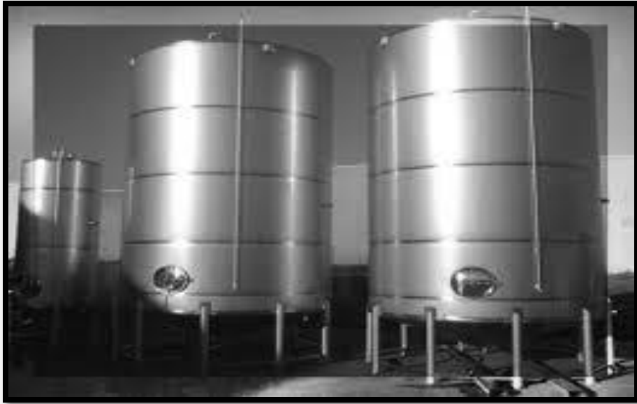
SS Storage Vessel