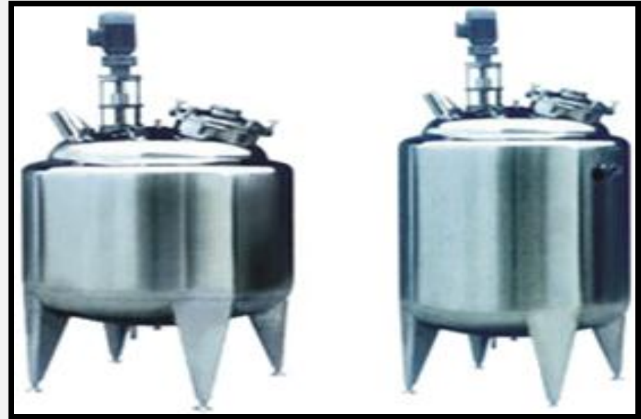
Stainless Steel Tanks with Closed Top and Agitator