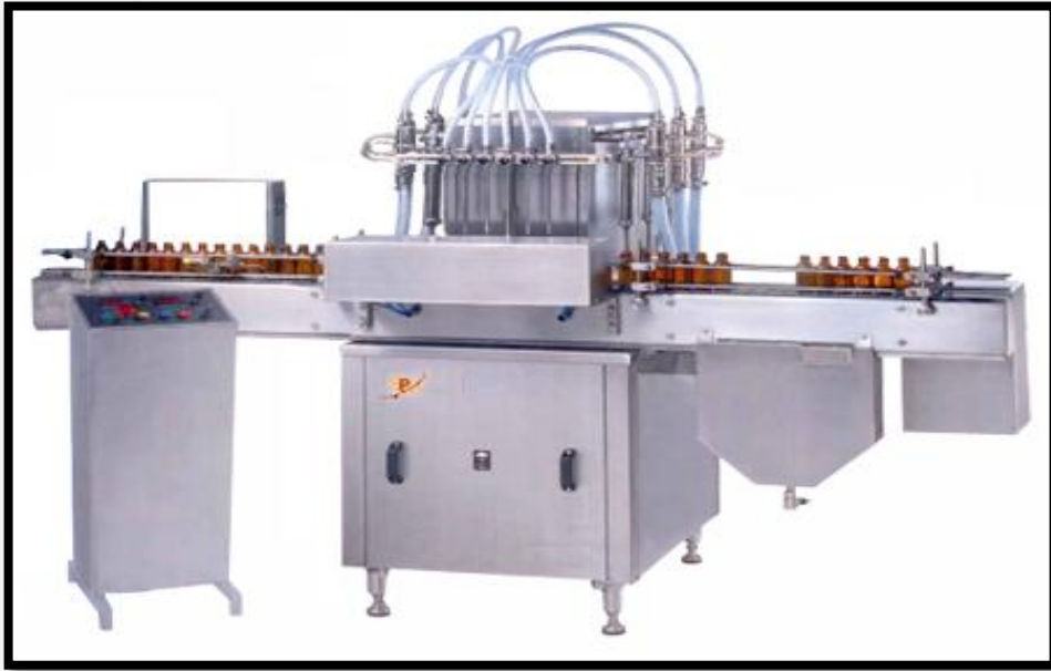
Liquid Filling Machine