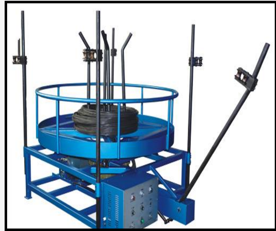
Wire Decoiling Machines