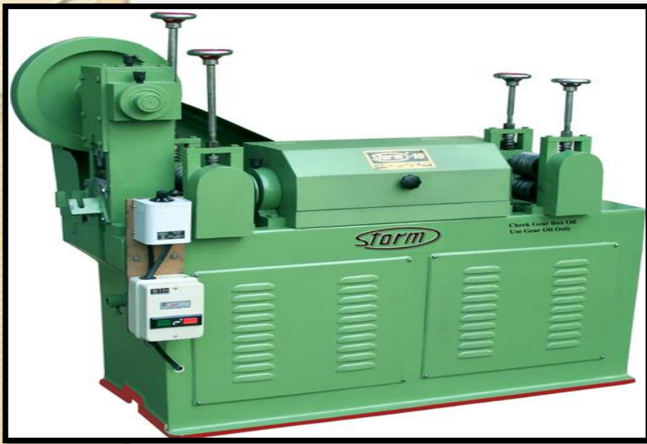
Wire Straightening and Cutting Machines