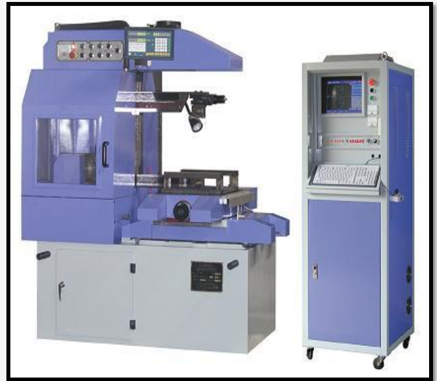
Wire Cutting Machine