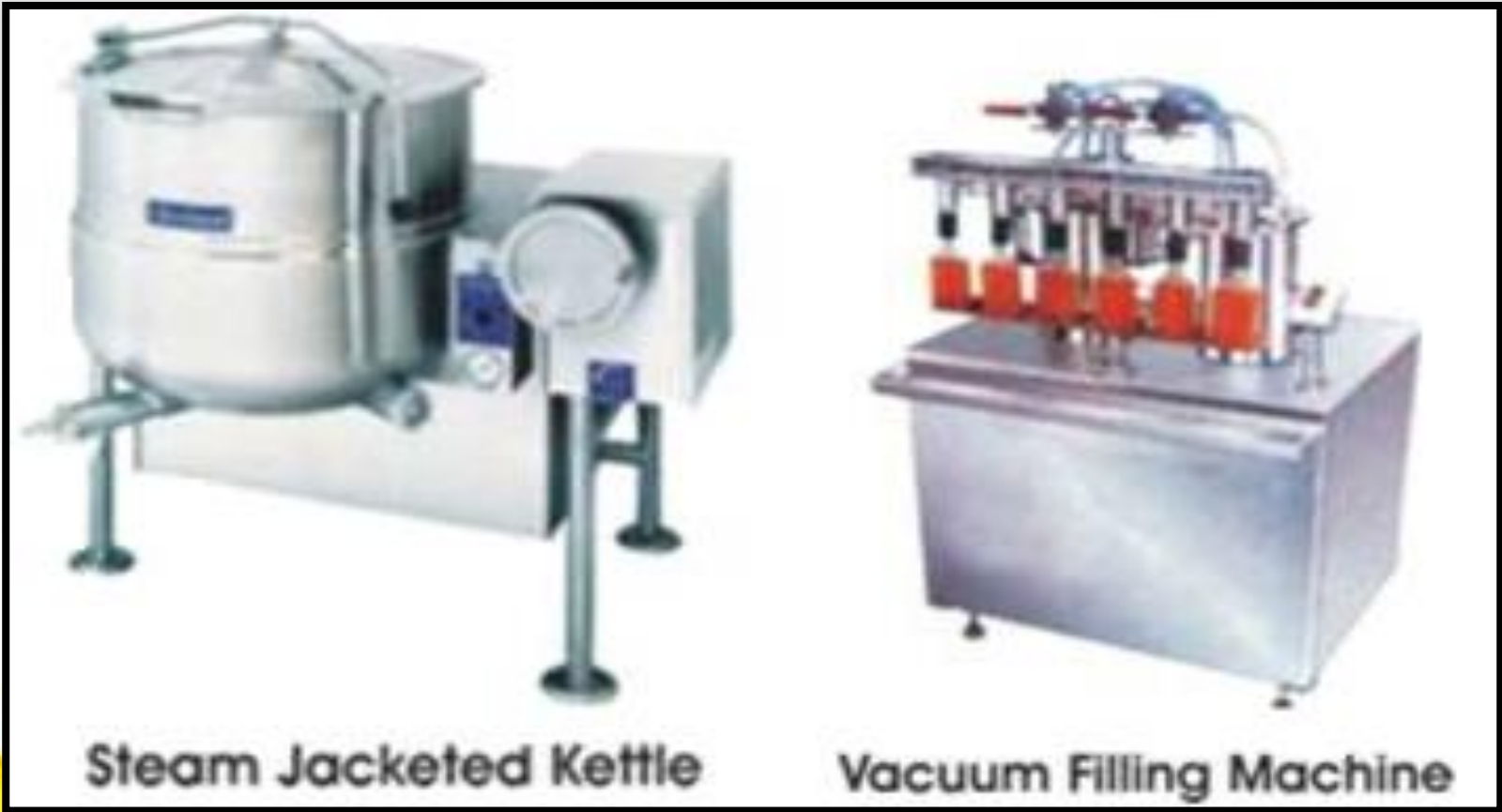
Steam Jacketed Kettle