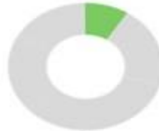
Others (Tray dried, vacuum, etc.)